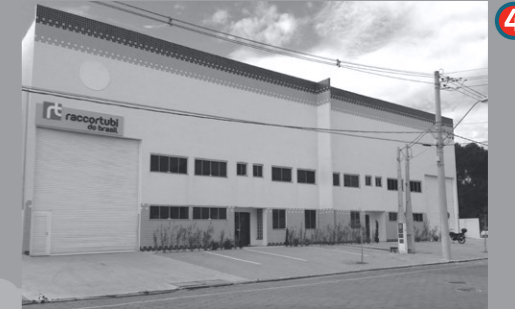
4 Stockholder and project supplier with internal fittings production.