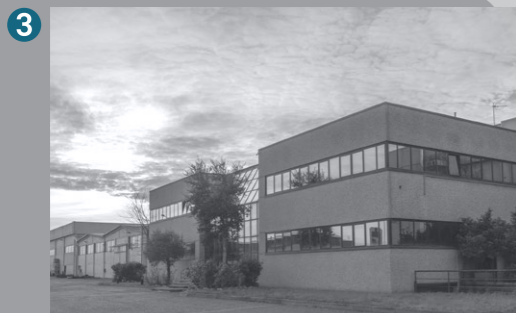
3 Butt weld fitting manufacturing, including on customer drawing, for oil & gas, power and nuclear applications.