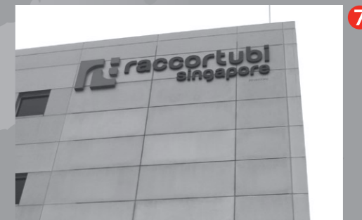
7 A large warehouse for all Southeast Asian piping needs.