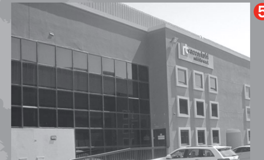
5 Large local stock from Dubai - Jebel Ali free zone.