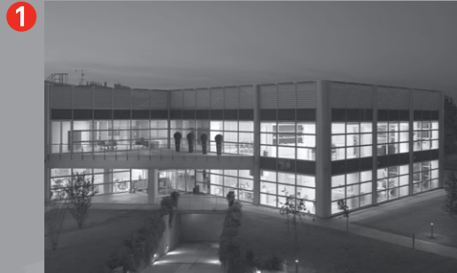
1 One-stop shop for all your piping needs, from a single piece to complete projects.