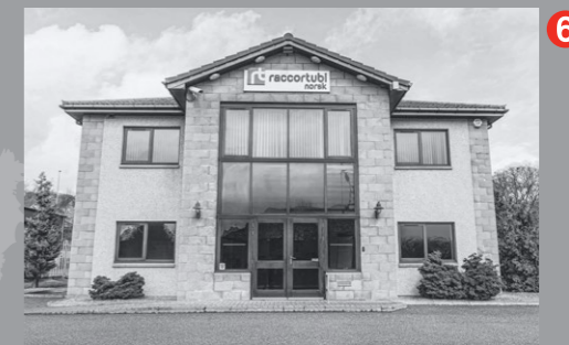
6 Your ideal partner for any North Sea offshore application.