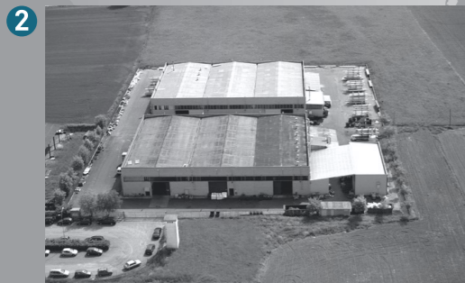
2 Stainless steel and special alloy butt weld fitting cold-forming.